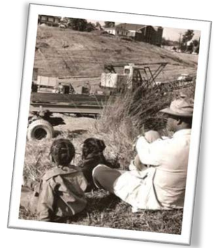
Building of Cross-Town (E-W) Expressway, 1958.